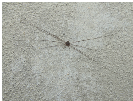
Fig. 4. Male of Dicranopalpus ramosus on the wall.