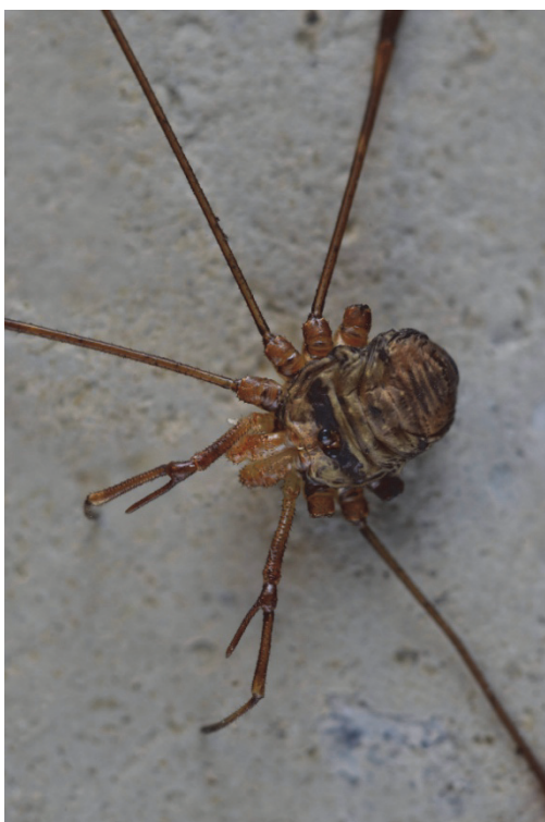
Fig. 3. Male of Dicranopalpus ramosus .